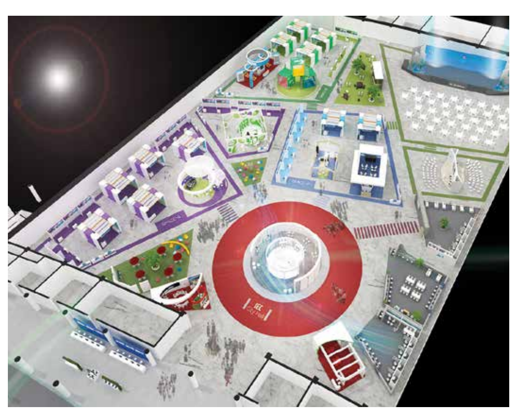
Floor plan for side events (tentative)

The Korean NC will create the small, but compact "IEC city" in Hall 1 of Exhibition Centre 1 of BEXCO, in parallel to the 82<sup>nd</sup> IEC General Meeting. The exhibition space of the electric and electronic companies will be set up in this "city" to present the companies' cutting-edge technologies and standardization activities. Also, "IEC city" will provide the opportunities for experts and the relevant publics to share their insights and experiences through technical seminars and the Global Convention on Standards Human Resources (HR) under the theme of standards education and related human resource development. The awarded papers from the IEC-IEEE-KATS Academic Challenge will also be presented in this convention. The Korean NC confidently expects that the "IEC city" will become the pivotal gathering place of "IEC citizens", who are inspiring knowledge exchangers, openminded communicators, and creative innovators throughout the 82<sup>nd</sup> IEC General Meeting.